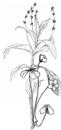
Wood Sorrel and the poisonous Dog's Mercury

Turn left and follow the drive up to a T-junction in the farmyard area. Here turn left and pass through a gate straight ahead.