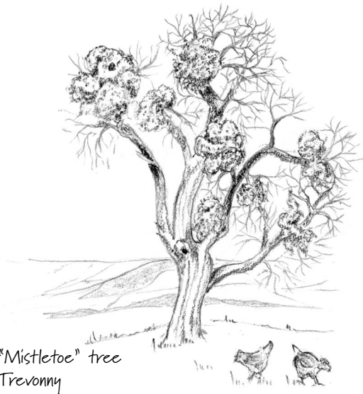
"Mistletoe" tree Trevonny

Mistletoe is quite common in this part of Britain and is very evident on this walk, especially on the branches of old fruit trees. There are good examples at Skenfrith Castle, Trevonny and Box Farm.