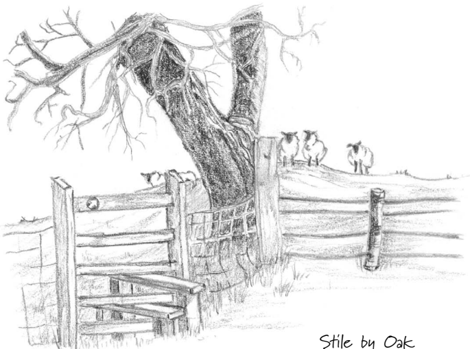
Stile by Oak

With two climbs on both walks of 165ft (50m) and 330ft (100m)