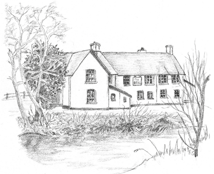
from the bell at skenfrith

Distance: 6 miles (9.5kms) Allow 3 hours With two climbs of 180ft (55m)