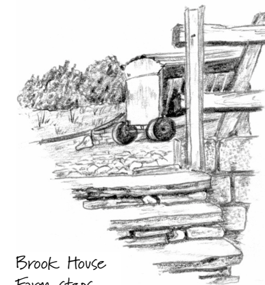
Brook House Farm steps

House Farm via three more gates. To avoid the farmyard, it is permitted to use the steps next to a barn to get to the lane. Turn left, go down and leave the lane at a stile on the left.