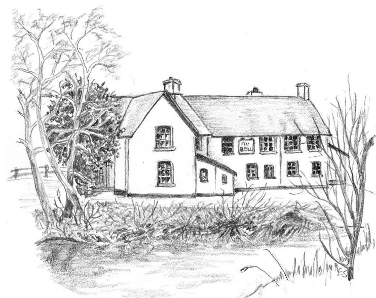
From The Bell at Skenfrith

Distances: Short Walk: 1½ miles (2.2kms) Allow ¾ hours Long Walk: 2½ miles (2.2kms) Allow 1½ hours