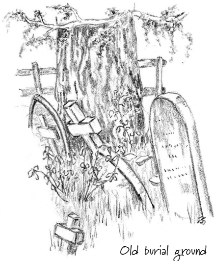
Old burial ground

Towards the end of the track is a stone wall surrounding an old burial ground. This is virtually all that remains of St. Mary's Catholic Church, priest's house, school room and barn, built between 1844 and 1846 and pulled down in 1911.