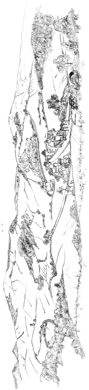
View from Coedanghred Hill