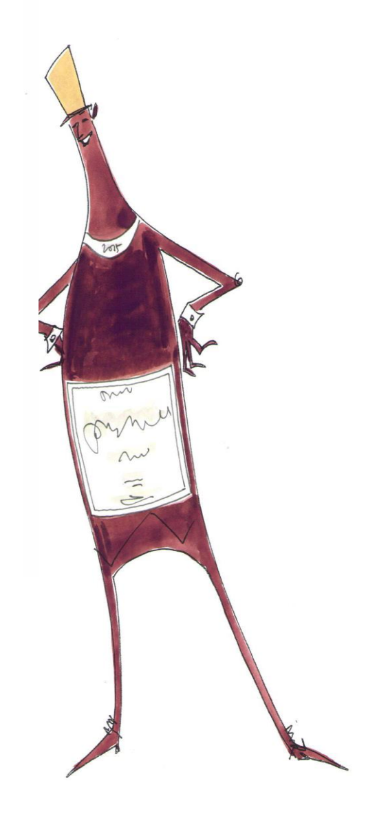
smooth and approachable