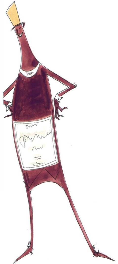
Smooth and approachable