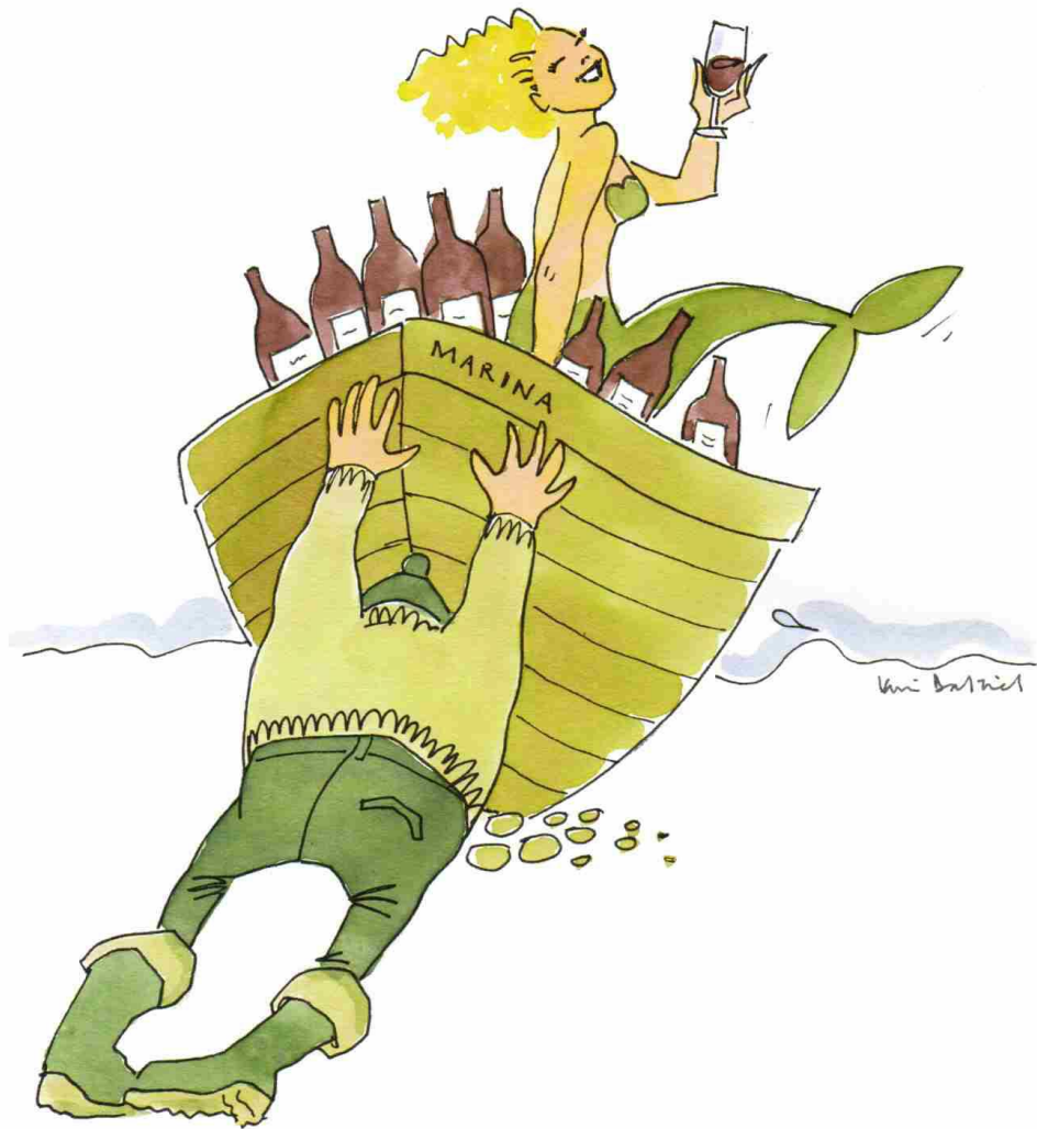
Pushing the boat out